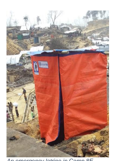
An emergency latrine in Camp 8E

With 750 latrines having been destroyed in Camp 8E and 8W, a total of 82 emergency latrines have been constructed which can provide access to 4,100 people in line with the SPHERE standard of 50 people per latrine during acute emergency. UNICEF is also prioritizing areas where people have returned and are rebuilding their homes as locations for the construction of emergency latrines.