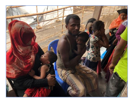
Father queuing for his child to be screened

Two INFs in Camp 9 and Camp 8E were destroyed by the fire. Despite this, both INFs have been made functional by UNICEF and its partners and started providing emergency nutrition services including the screening and management of acute malnutrition within 24 hours of the fire. On 24 March 2021, 302 children (175 girls and 127 boys) were screened for acute malnutrition and 23 children (18 girls and 5 boys) were identified as severe acute malnourished and provided with Ready-to-Use Therapeutic Food (RUTF). UNICEF and partners temporarily mobilised INF staff from neighbouring camps to provide support. Two breastfeeding corners have been established in the two INFs that supported over 50 mothers to breastfeed their babies. Mothers expressed satisfaction to have a private, and safe place for breastfeeding. Play areas were also established in both INFs to alleviate child sufferings and over 33 children benefitted from playing there.