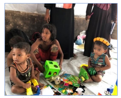
Children playing at the INF

Nutrition teams from UNICEF and WFP jointly visited the affected areas to assess the needs and guide the response. Based on the findings of the assessment, access to water is one of the most urgent needs, and steps have been initiated to provide water at the two INFs.