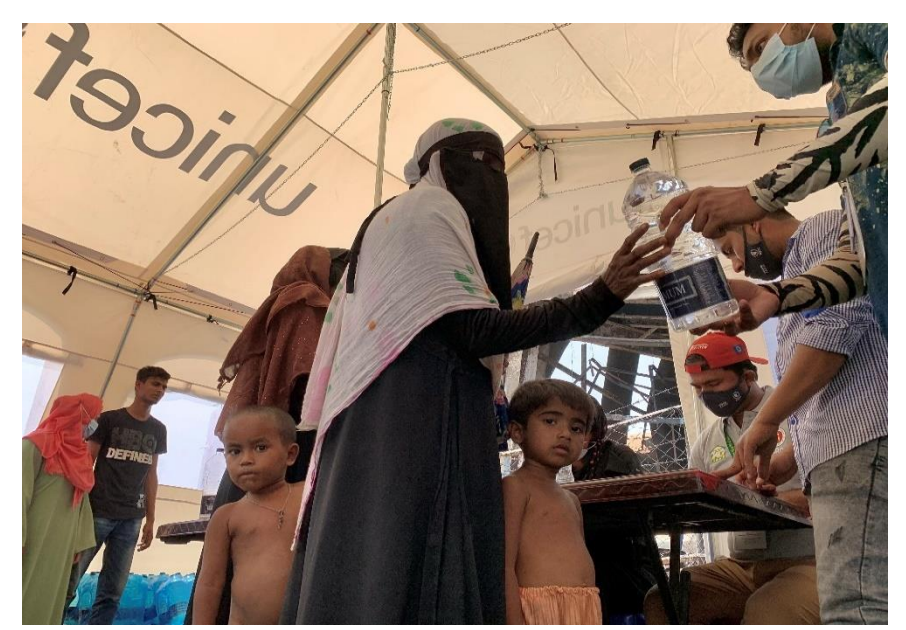
Families gather in an emergency UNICEF nutrition point set up in the aftermath of a massive fire