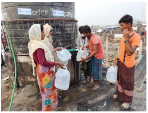
People collect safe water from a UNICEF temporary water distribution point in Camp 8W

In Camp 8E and 8W, six water supply networks and 190 tube wells have been damaged. Two of the water supply networks have been repaired with the damaged solar panels replaced and portable generators set up to pump up and provide safe water at distribution points. So far, 76 of the damaged tube wells have been repaired. In total, safe water is being provided to an estimated 12,500 people.