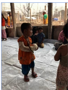
Girl with fractured arm playing at the INF